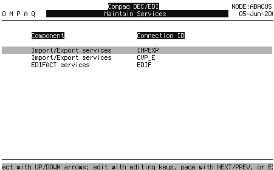
Figure 2-1 Maintain Services Screen