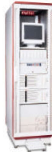
42U enclosure shown with clustered DIGITAL Servers